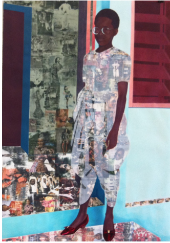
Njideka Akunyili, Beautiful One , 2012