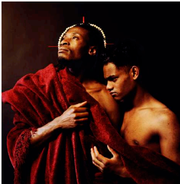
Every Moment Counts (Ecstatic Antibodies) , 1989. © Rotimi Fani-Kayode. Courtesy of Autograph ABP and Tiwani Contemporary, London

Tiwani Contemporary 16 Little Portland Street London W1W 8BP tel. +44 (0) 20 7631 3808 www.tiwani.co.uk