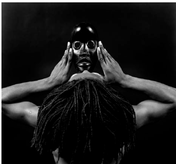
Dan Mask , 1989. © Rotimi Fani-Kayode. Courtesy of Autograph ABP and Tiwani Contemporary, London