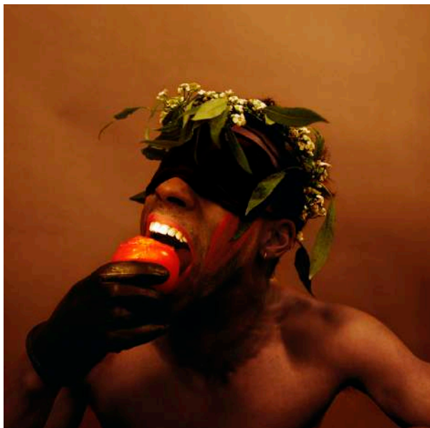
Untitled, 1987 – 1988. © Rotimi Fani-Kayode. Courtesy of Autograph ABP and Tiwani Contemporary, London

Fani-Kayode’s photographic portraits explore complex personal and politically-engaged notions of desire, spirituality and cultural dislocation . They depict the black male body as a focal point both to interpret and probe the boundaries of spiritual and erotic fantasy, and of cultural and sexual difference. Ancestral rituals and a provocative, multi-layered symbolism fuse with archetypal motifs from European and African cultures and subcultures - inspired by what Yoruba priests call “ the technique of ecstasy ”. Hence Fani-Kayode uses the medium of photography not only to question issues of sexuality and homoerotic desire, but also to address themes of diaspora and belonging , and the tensions between his homosexuality and his Yoruba upbringing . This exhibition coincides with the introduction in 2014 of new punitive legislation in Nigeria, as well as other countries in Africa, outlawing same-sex relationships and membership of gay rights organisations.