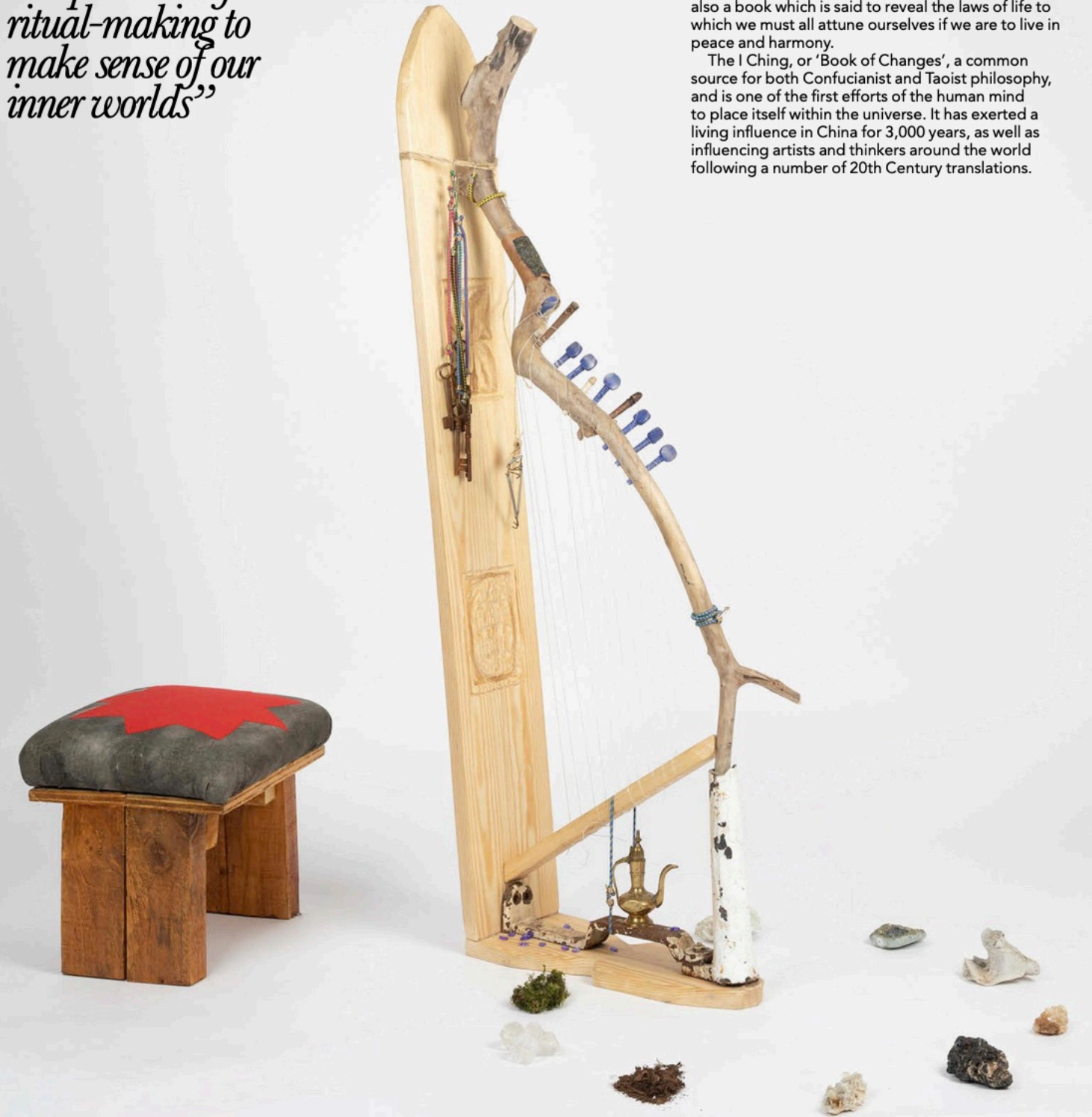
OPPOSITE, TOP: Untitled (Garment 1) ; OPPOSITE BELOW: Nine Dyads ; THIS PAGE: Harp for Nine Dyads (Part 1)