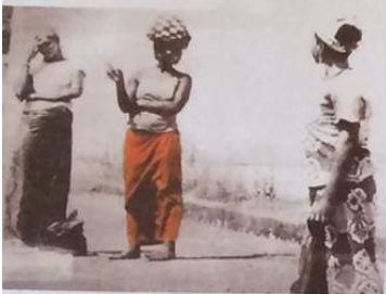
Amina Benbouhcha, 'Untitled 04', 2015, Print of Fine Art Baryta paper, edition of 5, 50 x 40 cm

Amina Benbouhcha has devoted her practice to anthropological reflection on the interdependence of the environment, objects of everyday life and humanity. Working with painting, photography, sculpture, installation, and video, Benbouhcha's work responds to her experience of living as a contemporary woman in both public and private spheres.