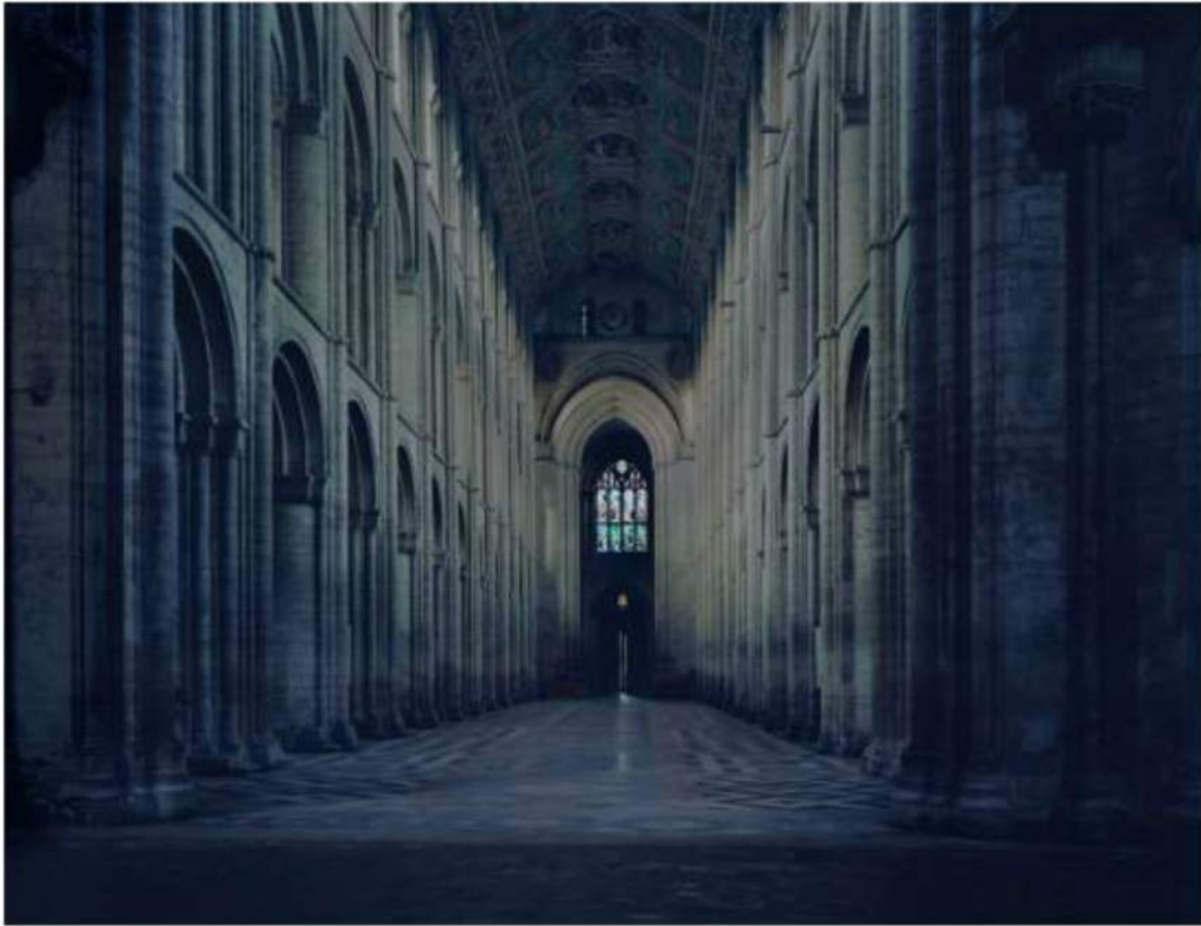
The Eve of St. Agnes by Harry Cory Wright