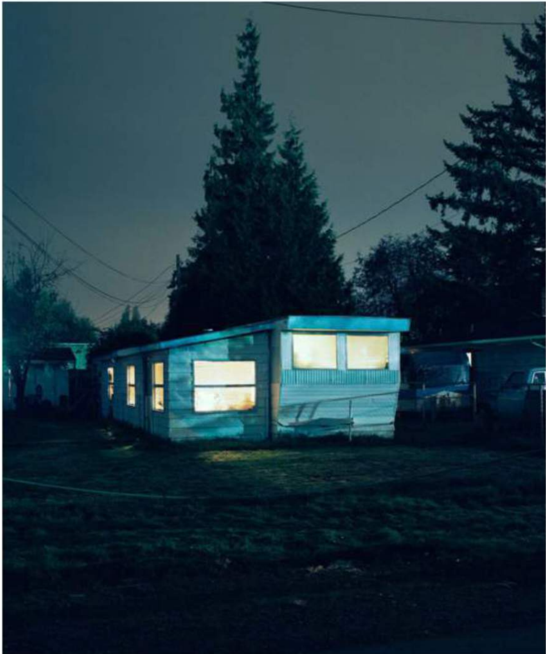
#2810, 2001 by Todd Hido, Courtesy of La Galerie Particulière