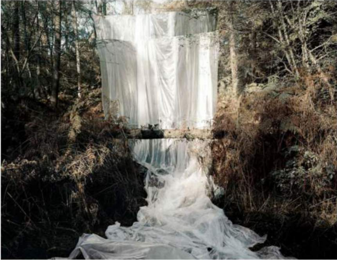
Cascade, 2009 by Noemie Goudal