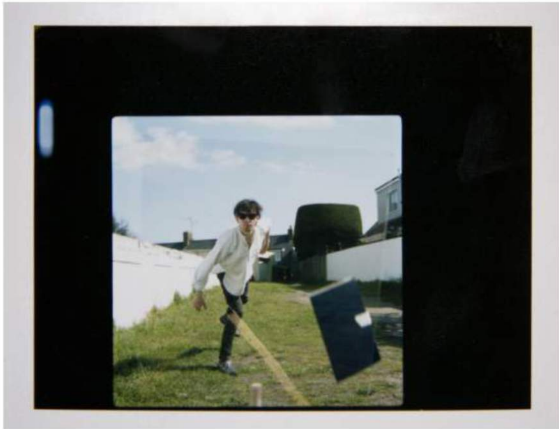
Potentials by Tom Pope, Courtesy of the artist