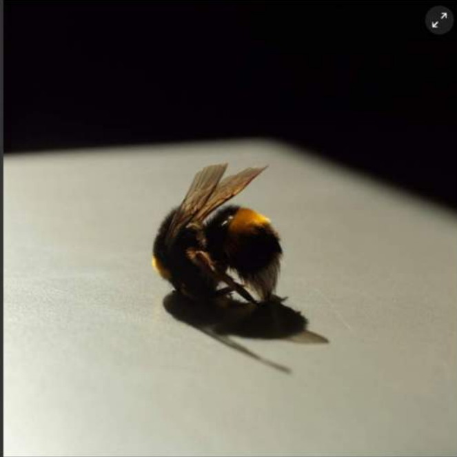
Bee by Lydia Goldblatt From the exhibition Still Here, at the Wapping Project Bankside, London SE1