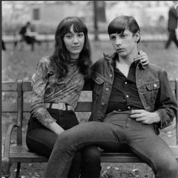
Young couple on a Bench in Washington Square Park, NYC, 1965, by Diane Arbus

At Timothy Taylor Gallery, London W1K