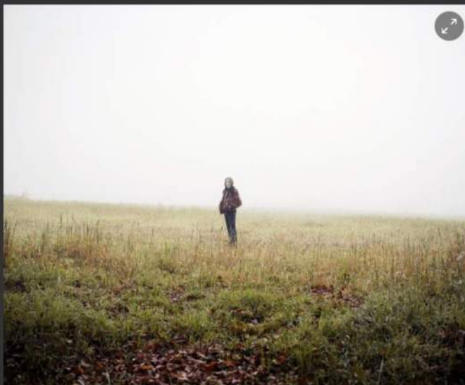
The Wait, 2015, by Ed Alcock

From Paris to Peckham: MYOP in London, at Safehouse 1, London SE15 Photograph: MYOP