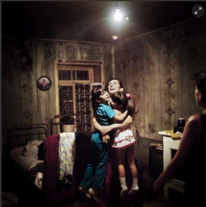
Nagomo-Karabakh, 2011, by Julien Pebrel From the exhibition Paris to Peckham: MYOP in London, at Safehouse 1, London SE15 Photograph: MYOP