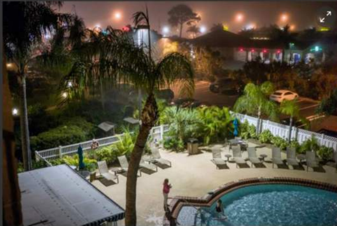
Sarasota US, 2014, by Guillaume Binet

From Paris to Peckham: MYOP in London, at Safehouse 1, London SE15 Photograph: MYOP