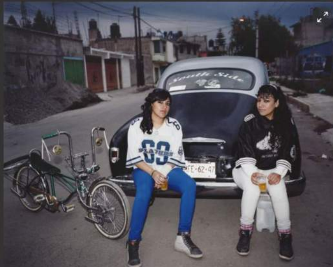
Pepe, 2013, by Bronia Stewart

From the exhibition Stare, at Four Corners Gallery, London E2