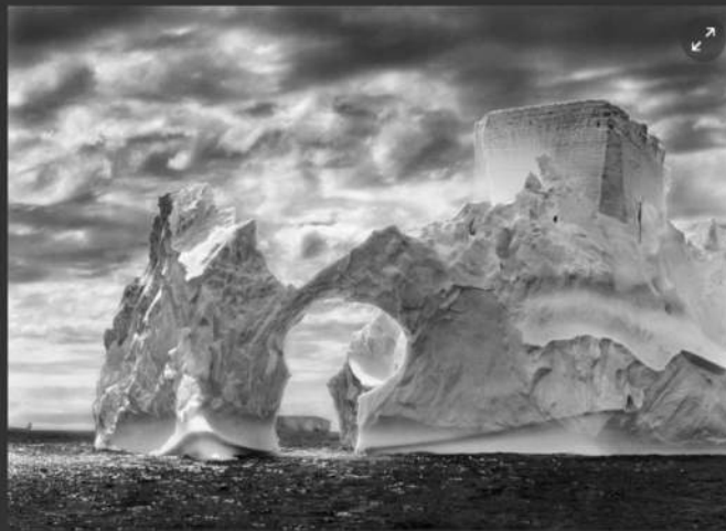
Antarctica, 2005, by Sebastião Salgado

Iceberg on the Antarctica Canal, from Genesis series, exhibition at the Photographers' Gallery, London W1F Photograph: Amazonas/fbpictures.com