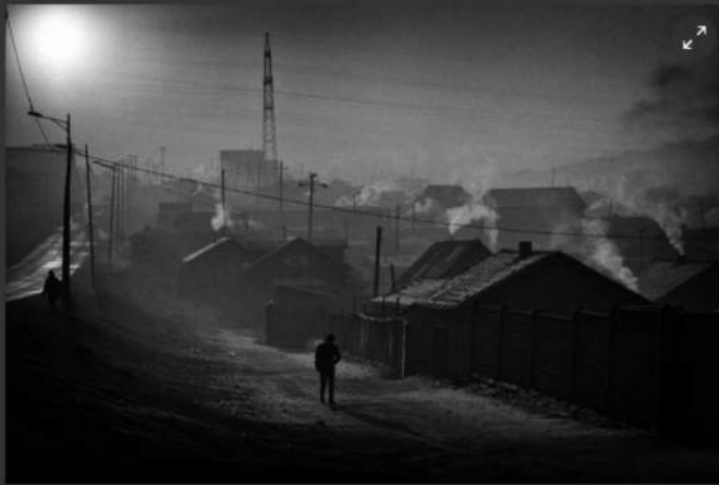
Mongolia, 2014, by Olivier Laban-Mattei

From Paris to Peckham: MYOP in London, at Safehouse 1, London SE15 Photograph: MYOP